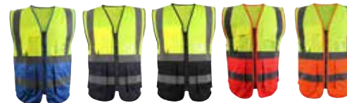
803018 Class 1