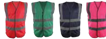
803013 Class 1